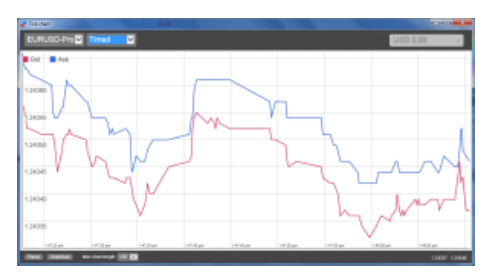
(This chart covers the same period as the tick chart example above.)